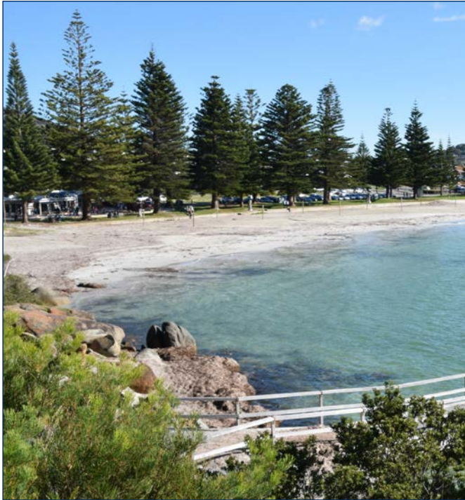
Albany's Middleton Beach will have better facilities for users and for events.