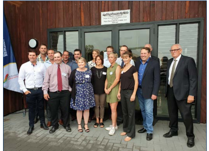
The Nyabing community and guests gathered in March to open the new community hub.