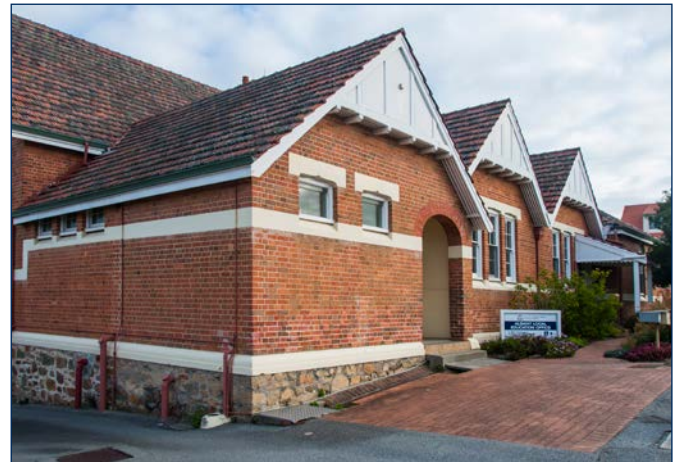
New facilities at the former Albany Primary School site in Serpentine Road will host students in affordable accommodation.