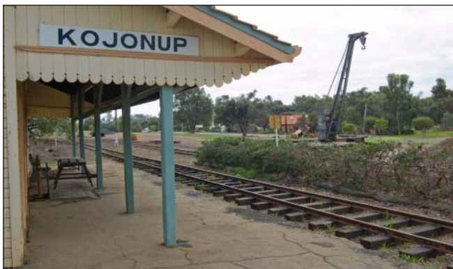
Extensions to the Albany Surf Life Saving Club (above) and development of the Kojonup Tourist Railway (left) are among projects approved in the second round of RGS funding.

Barker and Kendenup will enjoy upgraded recreation facilities.