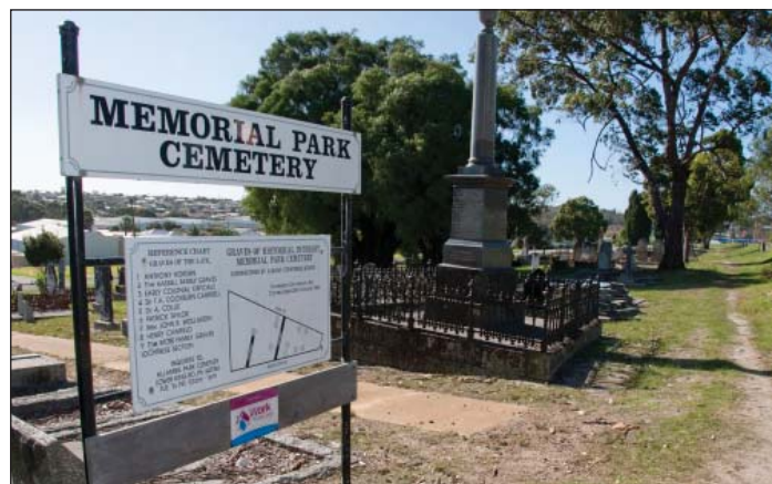
Royalties for Regions funding will help to preserve and protect Albany's historic Memorial Park Cemetery.

Perth International Arts Festival: PIAF 2011-2013 Great Southern Program, $225,000