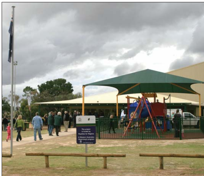
Woodanilling residents and visitors explore the new facilities in the town's recreation precinct on the opening day.