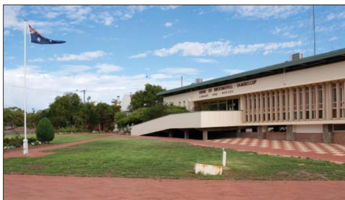
The Shire of Broomehill-Tambellup will assess the feasibility of converting a former Shire office into a regional archive repository.

Mungart Boodja Inc: Regional Arts Development Initiative in Katanning, $21,000