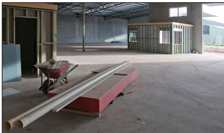
Activ Industries' new warehouse in Minna Street Albany provides the organisation with 1400 sq m of floor space.