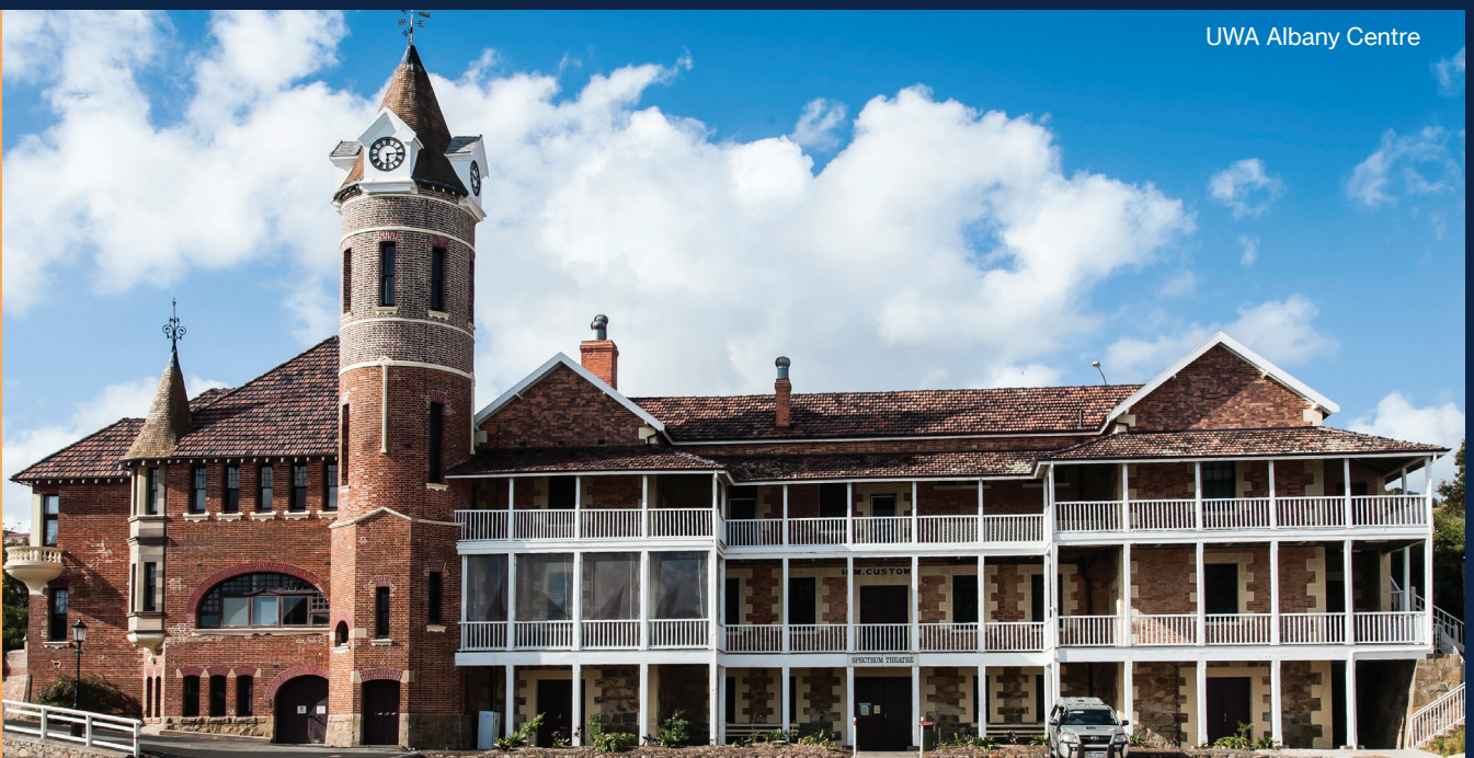
UWA Albany Centre

Due to the significant uptake of the Regional University Hub's services and facilities in Albany, Regional Development Australia (who currently manage the hub) are investigating opportunities to expand the facilities in Albany, and to also provide satellite services in towns across the region. This hub and spoke model would potentially enable both domestic and international students to live and work across the region, not just in Albany.